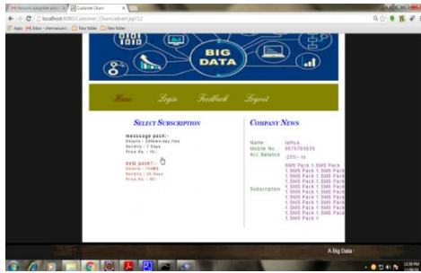
(c).Customer Subscription details.