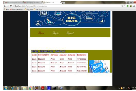
(d). Feedback from the customer.